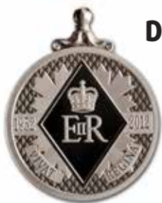
Queen Elizabeth II Diamond Jubilee Medal