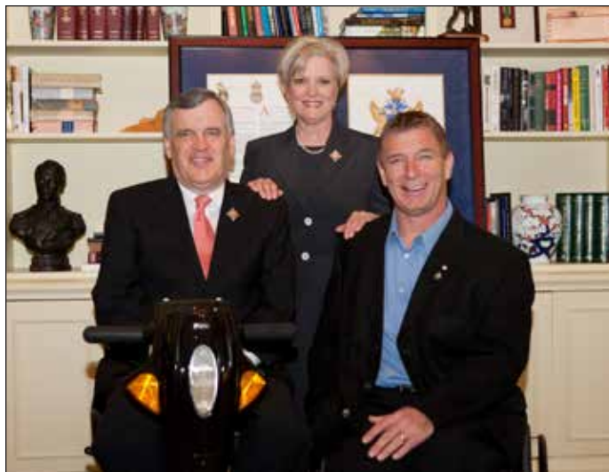
Their Honours welcomed Paralympian and philanthropist Rick Hansen to the Lieutenant Governor's Suite

A concerted effort was made to increase public access while art installations were displayed in the suite. Regular postings on the Lieutenant Governor's Facebook page, Twitter feed and Huffington Post blog contributed to a marked increase in tour requests during exhibitions.