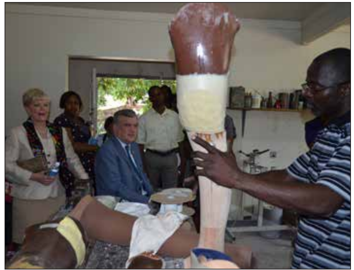
Touring the prosthetics workshop at the Sir John Golding Rehabilitation Centre

Awareness of the competition gained traction through His Honour's blog at the Huffington Post, and attracted more than 100 submissions from students around the world. Ultimately, the judges concluded the competition had not achieved its goal, although two designs were deemed worthy of honourable mentions for their promising concepts. The Inclusive Design Research Centre at OCAD U committed to working with the designers of both submissions, for presentation the following year at the International Summit on Accessibility in Ottawa. The designs were also featured in a February 2014 pop-up exhibit at the Museum of Modern Art in New York City.