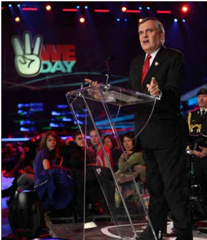
Speaking to the crowd at Toronto We Day celebrations