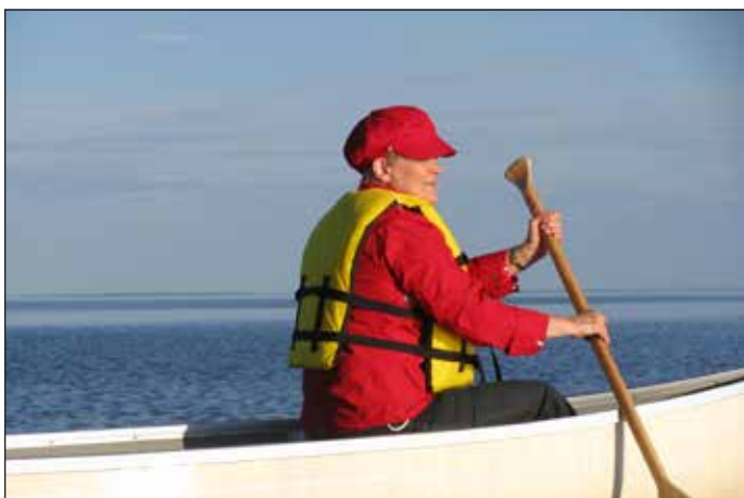
Her Honour captains a canoe during a trip to KI First Nation