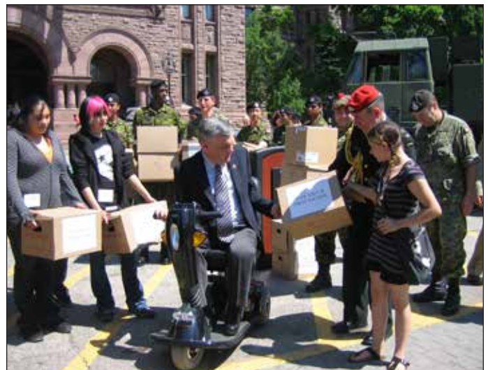
Loading books onto Canadian Forces trucks for distribution to First Nations