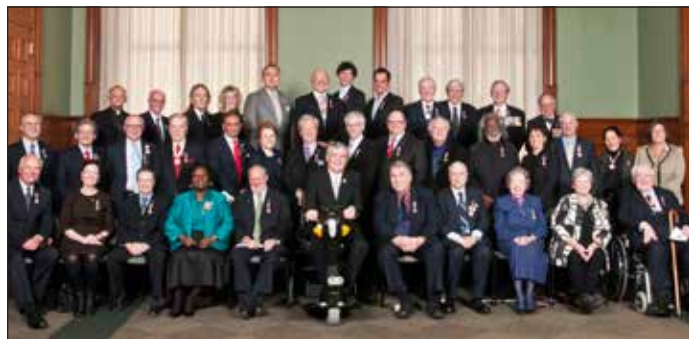
Ontario's first Diamond Jubilee medal recipients

The exhibition was displayed in the Lieutenant Governor's Suite until June 2013. Visitors had the opportunity to take home a commemorative exhibition catalogue, a copy of which was provided to each of Ontario's public libraries. Two launch events brought together a