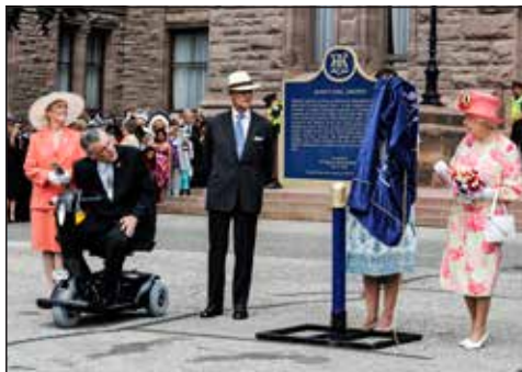
Their Honours accompany The Queen and The Duke of Edinburgh at Queen's Park, 2010