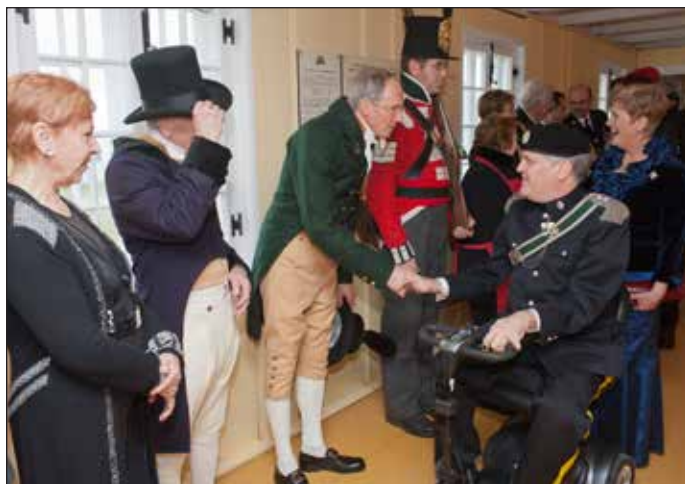
Their Honours meet War of 1812 re-enactors during the New Year's Levee at Fort George National Historic Site