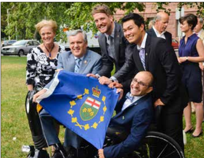
The viceregal standard flew once again in Toronto on July 23, 2012