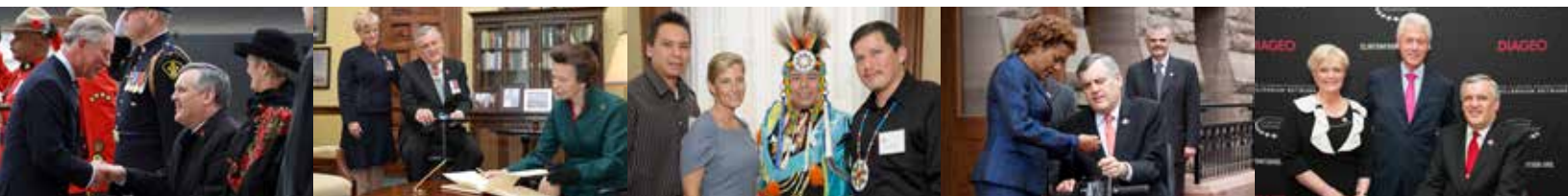
Greeting The Prince of Wales; The Princess Royal signs the Lieutenant Governor's guest book; The Countess of Wessex and members of Morningstar River Drummers; Then Governor General Michaëlle Jean presents a gift to Mr. Onley; Meeting former US president Bill Clinton

Rolling out the red carpet and celebrating significant moments