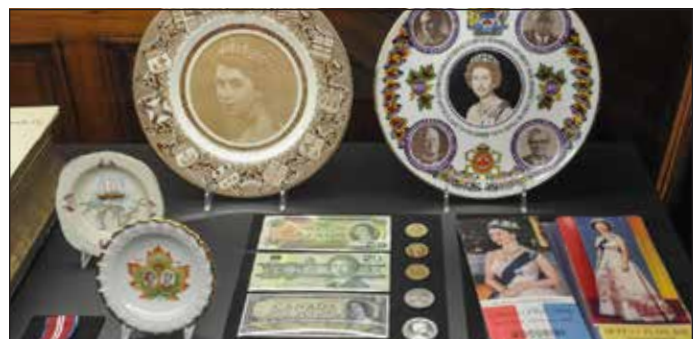
Memorabilia as part of the 60 in 60 exhibition