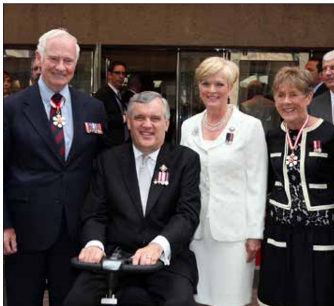
Their Honours pose with the Governor General and Mrs. Johnston during the 2012 Diamond Jubilee Gala in Toronto