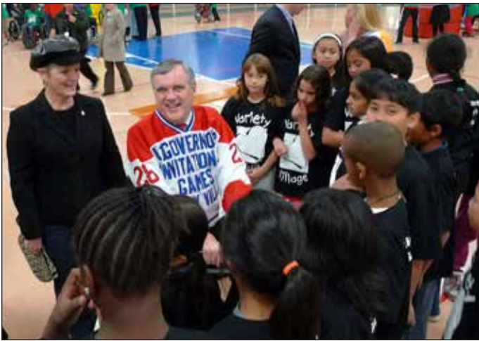
Their Honours meet participants during the Lieutenant Governor's Games at Variety Village