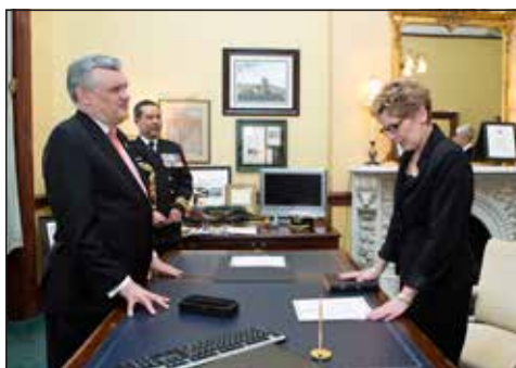
The Hon. Kathleen Wynne is sworn in as the 25th Premier of Ontario, 2013