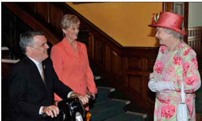
Their Honours greet Her Majesty The Queen in the Lieutenant Governor's Suite at Queen's Park