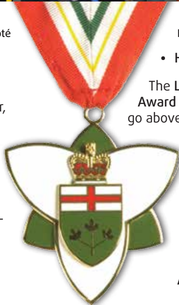
Insignia of the Order of Ontario

In his capacity as Chancellor of the Order of Ontario , the province's highest official honour, Mr. Onley presided over seven investiture ceremonies, honouring 194 appointees. Created in 1986, the order recognizes any current or former long-time resident of Ontario who has demonstrated a high level of individual excellence and achievement in any field benefitting the people of Ontario or anywhere in the world.