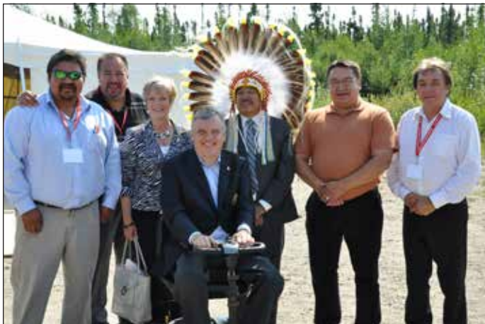
Their Honours visit Nibinamik First Nation

ABORIGINAL CULTURE CELEBRATION, NOVEMBER 2011