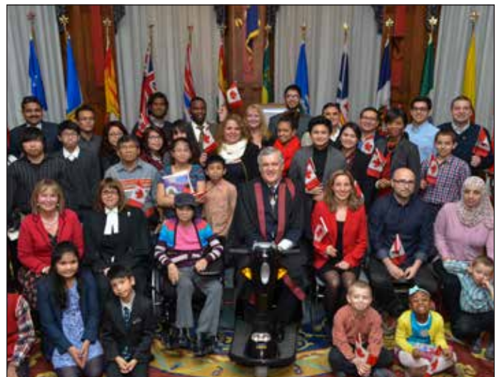
His Honour celebrates with new Canadians