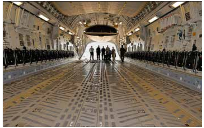
Their Honours aboard a transport plane during a tour of CFB Trenton

Since 2011, His Honour has served as Colonel of the Regiment of The Queen's York Rangers (1st American Regiment). The Rangers were brought to Upper Canada in 1792, by their erstwhile commander, Colonel John Graves Simcoe, to assist in the building of the province's new capital at York (now Toronto). When the Rangers approached the Lieutenant Governor with the request that he become honorary patron, he broached the idea of re-establishing the connection between the regiment and the Lieutenant Governor. The proposal receiving the strong support of the Chief of the Defence Staff and the Minister of National Defence. In September 2011,