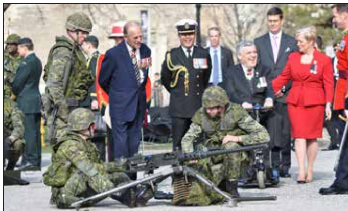
The Duke of Edinburgh observe a dynamic military display outside Queen's Park