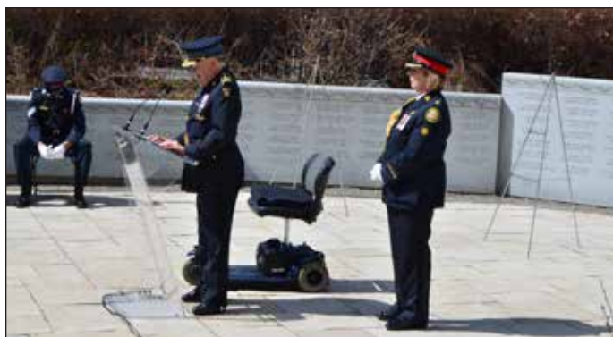
Wearing the OPP uniform, His Honour speaks at the Ontario Police Memorial

Throughout his tenure, His Honour presided at the annual Ontario Fire Fighters Memorial Ceremony and presented the Ontario Medals for Police and Firefighter Bravery.