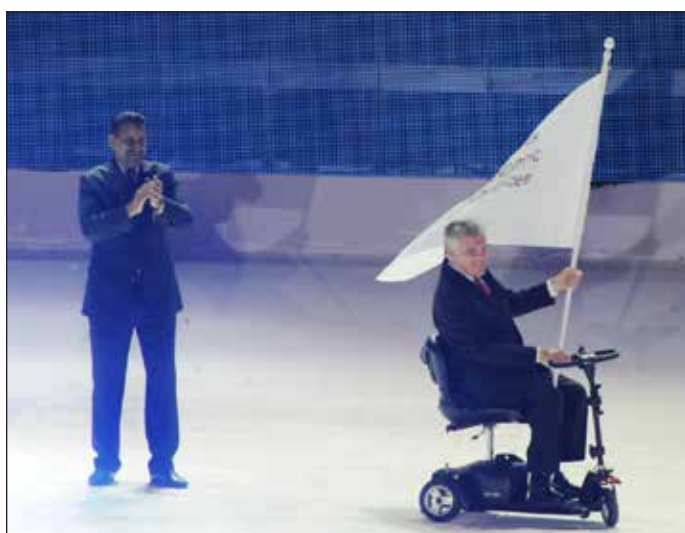
His Honour represents Ontario at the Guadalajara 2011 Parapan Am Games, receiving the flag in advance of the 2015 games in Toronto