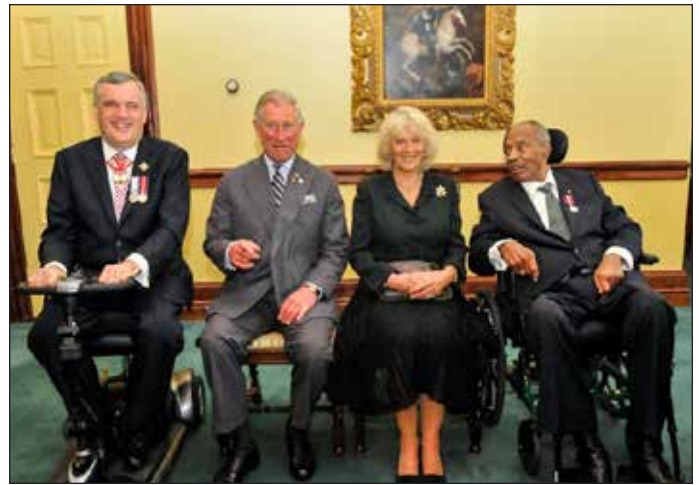
In 2012, The Prince of Wales and The Duchess of Cornwall visited the Lieutenant Governor's Suite, chatting briefly with Mr. Onley and the Hon. Lincoln Alexander

"To truly honour Nelson Mandela, I believe we must make truth and reconciliation an integral part of our lives."