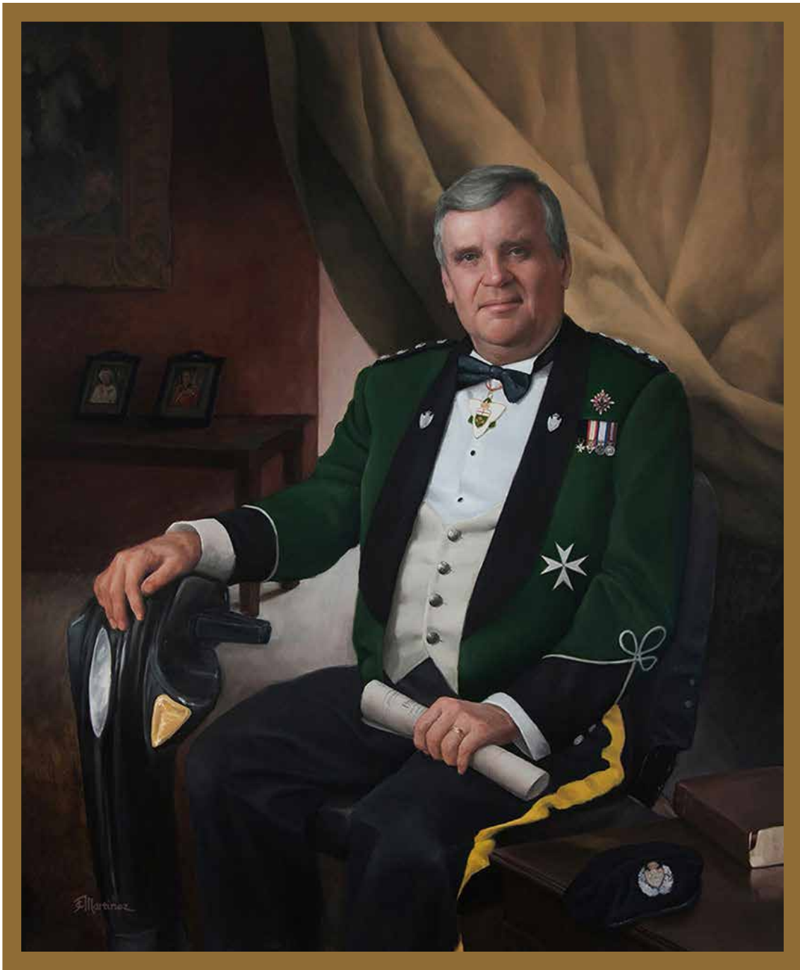
His Honour the Honourable David C. Onley, OOnt 28th Lieutenant Governor of Ontario

Shown in the uniform of Colonel of the Regiment of The Queen's York Rangers (1st American Regiment)