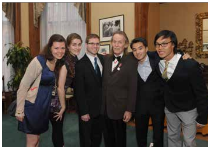
Students from Massey College pose with Diamond Jubilee medal recipient Gordon Lightfoot at the opening of 60 in 60

In the presence of Their Excellencies the Rt. Hon. David Johnston, Governor General of Canada, and Mrs. Johnston,