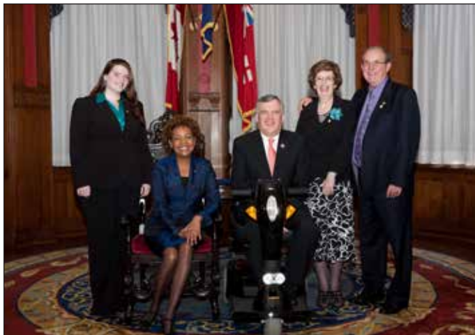
Ontario recipients of the Governor General's Caring Canadian Award

At the request of the Governor General, the Lieutenant Governor presents, from time to time, the Governor General's Caring Canadian Award , which recognizes living Canadians and permanent residents who have made a significant, sustained, unpaid contribution to their community, in Canada or abroad.