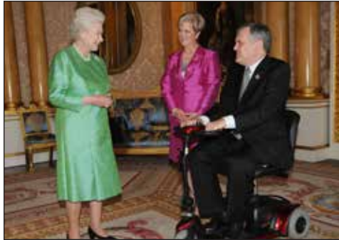
Her Majesty receives Their Honours at Buckingham Palace, 2008