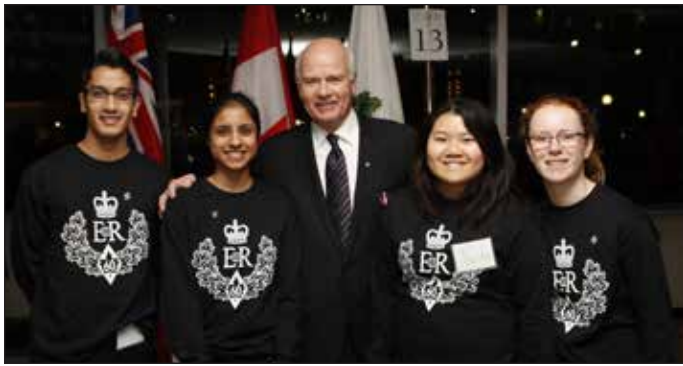
Master of ceremonies Peter Mansbridge poses with young volunteers at the second Diamond Jubilee Gala

Mr. Onley hosted a Diamond Jubilee Gala at Roy Thomson Hall in Toronto for over 1400 guests.