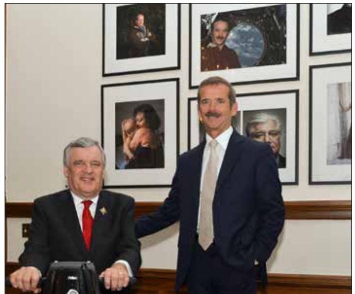
His Honour poses with astronaut Chris Hadfield beneath his portrait in the About Face exhibition

through the eyes of artist Charles Pachter . Both celebrated the diversity of Ontario's people.