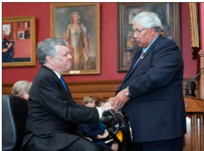
Mr. Onley was made an honorary witness of the Truth and Reconciliation Commission of Canada

Another outcome of the forum is the collaboration of a number of organizations with Frontier College in delivering educational resources and programs to Aboriginal communities in Ontario. These organizations include: One Laptop Per Child Canada, Prince's Charities Canada, and Right To Play.