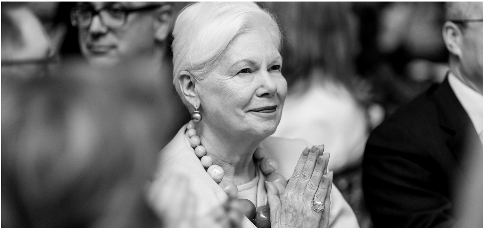
The Lieutenant Governor at an event in support of the Hennick Bridgepoint Hospital, 2019

It is with profound gratitude that I present my End of Mandate Report to the people of Ontario. This report covers the primary themes, key moments, and chief accomplishments during my term as the Lieutenant Governor of Ontario.