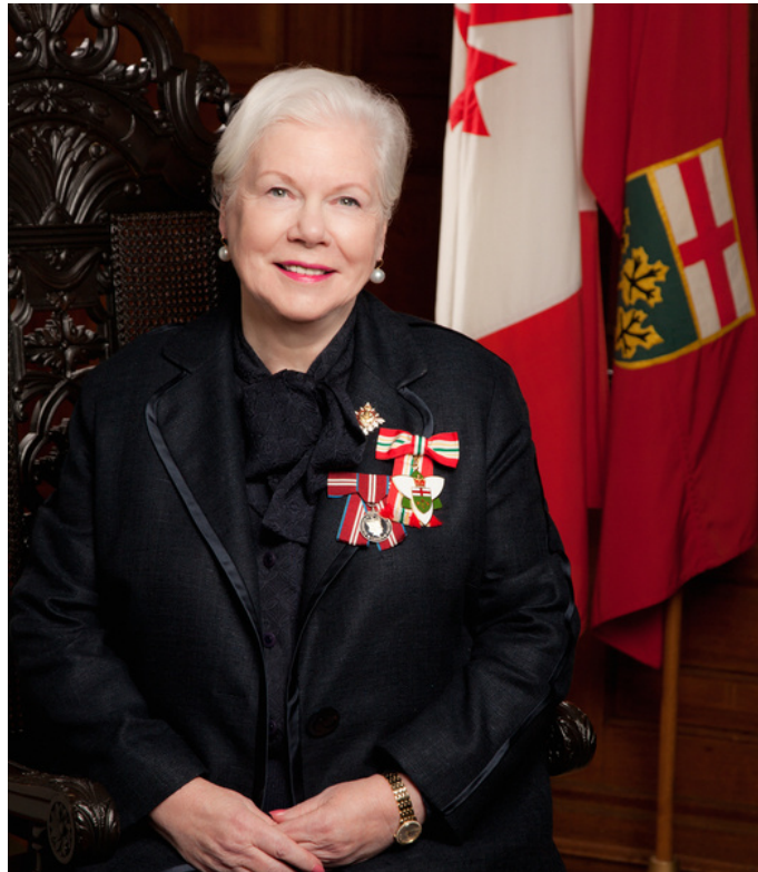
A portrait of the Honourable Elizabeth Dowdeswell

The Honourable Elizabeth Dowdeswell is the 29th Lieutenant Governor of Ontario and is the longest-serving Lieutenant Governor in the history of the province. As the representative of His Majesty The King, Ms. Dowdeswell carried out constitutional and ceremonial duties and facilitated healthy citizen and community engagement.