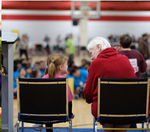
The Lieutenant Governor with a young participant of the LG Games at Variety Village, 2019