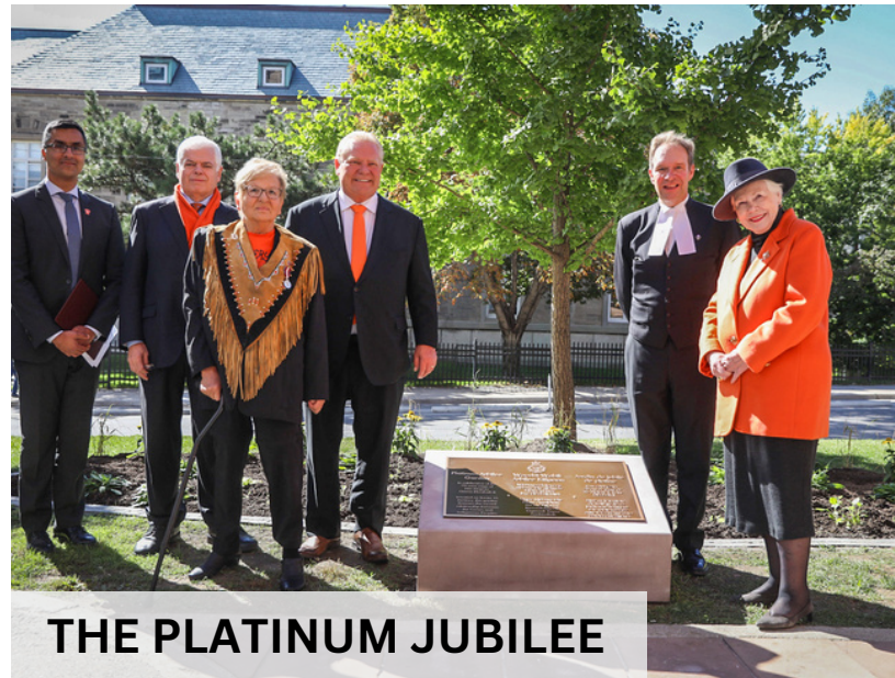
Top: The Lieutenant Governor with a group seated at a table covered in afternoon tea treats. Union Jack bunting is on the wall, 2022