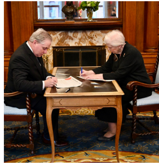
The Lieutenant Governor and Chief Electoral Officer Greg Essensa, seated at a table signing writs for a by-election, 2022