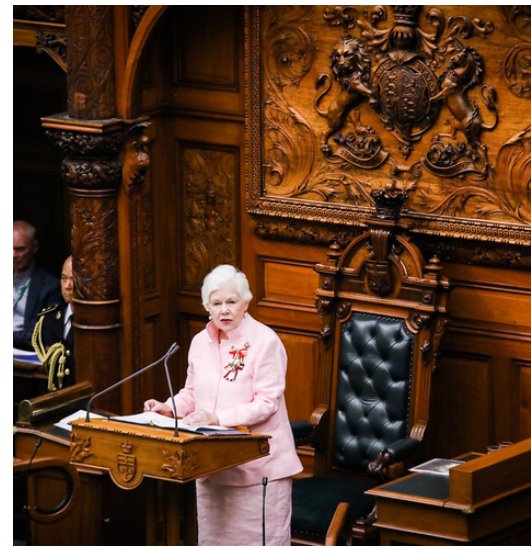
The Lieutenant Governor delivering the Speech from the Throne, 2022

The Lieutenant Governor remains strictly nonpartisan in carrying out her constitutional duties. In doing so, the Lieutenant Governor ensures that the democratic will of Ontarians and their elected representatives is upheld.