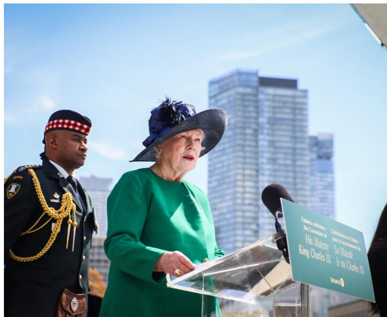
Top: The Lieutenant Governor at the Accession Ceremony for King Charles III, 2022