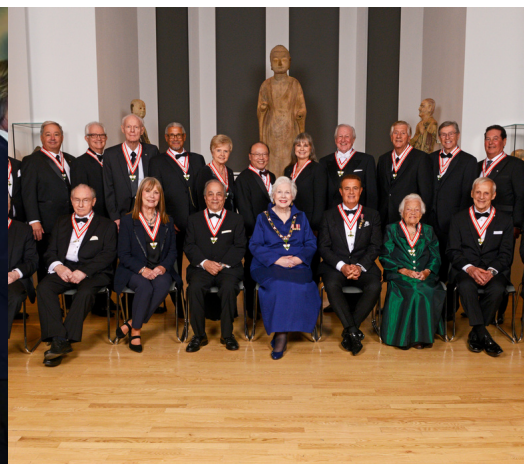
The Lieutenant Governor with new appointees to the Order of Ontario, 2022