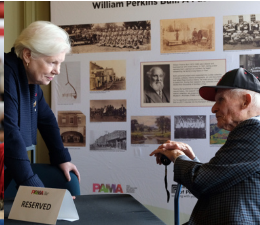
The Lieutenant Governor speaking to former Premier Bill Davis at the 50th anniversary of PAMA, 2018