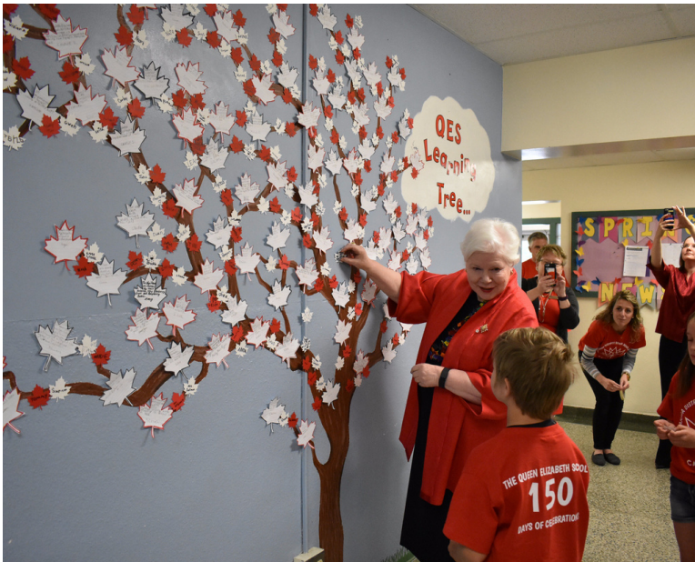
Top and bottom: The Lieutenant Governor visiting the Queen Elizabeth Public School in Perth for Canada 150, 2017