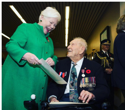
The Lieutenant Governor with a veteran, 2018

The Lieutenant Governor plays an important role in promoting a sense of identity among the people of Ontario, bringing awareness to the need for reconciliation with Indigenous Peoples, and encouraging Ontarians to take part in voluntary service and activities aimed at building more just and sustainable communities.