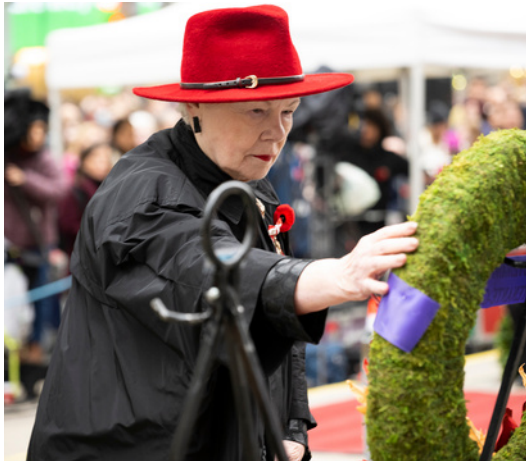
The Lieutenant Governor laying a wreath at the Korean War Memorial, 2022