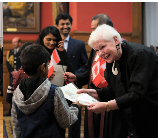
The Lieutenant Governor participating in a citizenship ceremony in the Lieutenant Governor's Suite, 2019