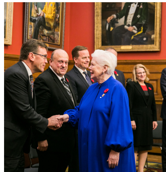
The Lieutenant Governor at a swearing-in ceremony for members of the Executive Council (Cabinet) 2018