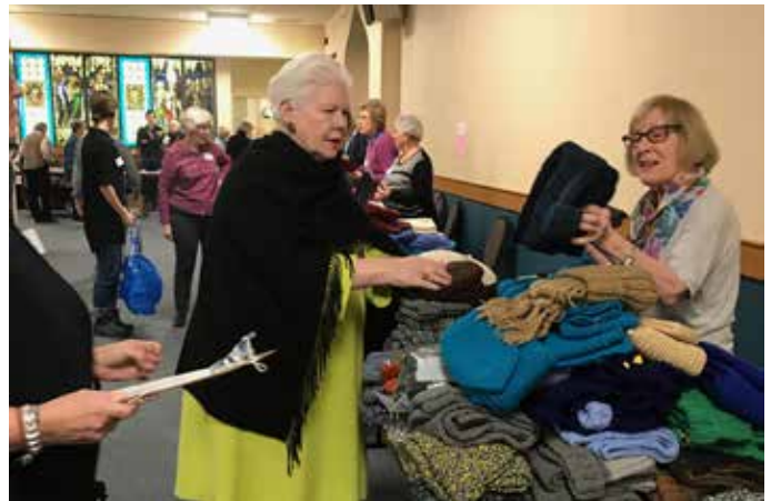
Her Honour met volunteers during a visit to the Toronto chapter of the Needlework Guild of Canada, November 2017.

In December, the Lieutenant Governor hosted a reception to mark the successful participation of the Ontario Public Service in the United Way of Greater Toronto's annual fundraiser.