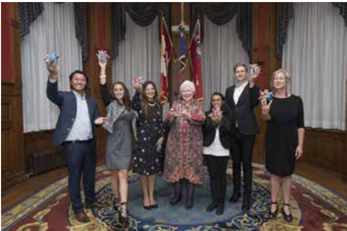
Her Honour posing with Lieutenant Governor's Visionary Prize category winners, October 2017.