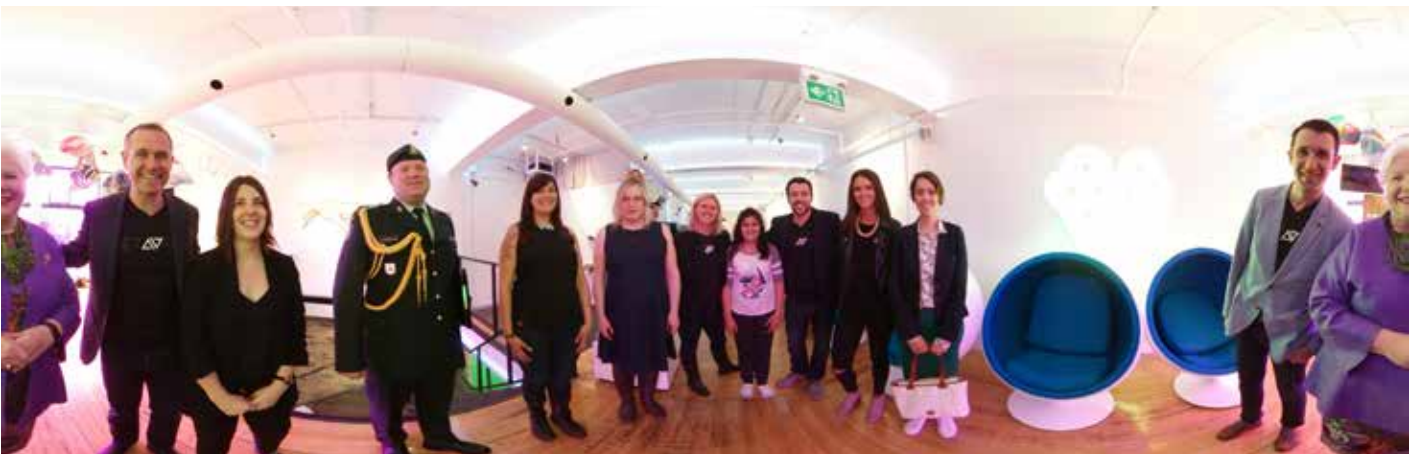
Her Honour posing in a 360° photo with participants and organizers of a coding event at the House of VR in Toronto, June 2017.

In April, Her Honour welcomed members of the anti-bullying club at Pierre Laporte Public School in Toronto for a tour of the Lieutenant Governor's Suite. To mark Jewish Heritage Month in May, Her Honour joined students at John Polanyi Collegiate Institute in Toronto to view Anne Frank—A history for today , a travelling expedition on loan from the Anne Frank House in Amsterdam. Also in May, she joined students at Winona Drive Public School in Toronto in welcoming young Quebecers participating in the Experiences Canada exchange program. To mark Canada Learning Code Week in June, Her Honour joined students from Zion Heights Middle School at the House of VR in Toronto to learn the basics of coding and virtual reality. Throughout the year, Her Honour paid visits to students, including at Queen Elizabeth Public School in Perth (June 2017) and Queen Victoria Public School in Windsor (September 2017).