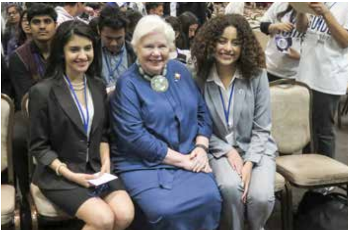
Her Honour posing with participants of the Canada Youth STEM Conference, May 2017.

The Lieutenant Governor recognizes the capacity of the arts to foster social cohesion and promote a shared cultural understanding. To this end, Her Honour regularly interacted with heritage, arts, and cultural organizations while travelling throughout Ontario, noting the contributions of cultural institutions in bringing people together. Her Honour regularly received incoming heads of significant cultural institutions in Ontario, and paid tribute to outgoing CEO of the National Arts Centre, Peter Herrndorf. Ms. Dowdeswell also regularly viewed exhibitions across Ontario, including at the Peel Art Gallery Museum and Archives, Textile Museum of Canada.