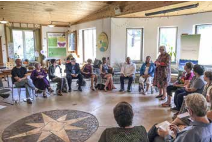
Her Honour took part in a roundtable during a visit to the Regional Centre of Expertise on Education in Sustainable Development in Peterborough, September 2017.

As a former Executive Director of the United Nations Environment Programme, Her Honour regularly highlights the many connections that Ontarians have with the UN, engaging with people and organizations contributing to the adoption and attainment of the UN's Sustainable Development Goals. A few notable examples appear in subsequent pages.