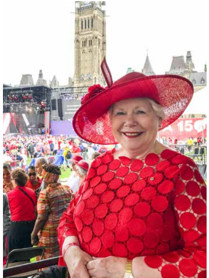
The Lieutenant Governor at Canada Day celebrations on Parliament Hill, July 2017.

On July 1, in the presence of the Governor General and Their Royal Highnesses, the Lieutenant Governor attended the opening ceremony of Canada Day celebrations on Parliament Hill, joining tens of thousands of spectators despite the rainy weather. Her Honour also took part in the dedication of the Canadian History Hall at the Canadian Museum of History, the reopening of the National Arts Centre, and the inauguration of The Queen's Entrance at Rideau Hall, marking Her Majesty's Sapphire Jubilee.