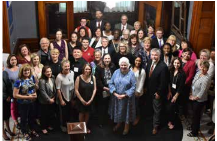
Her Honour posing with participants and organizers of Changing the Game, Changing the Conversation, June 2017.

Throughout 2017 and 2018, the Lieutenant Governor participated in a number of events in support of Changing the Game, Changing the Conversation, a Canada 150 initiative of Coaches Ontario in which mentors hundreds of new female coaches in all sports across the province. Throughout, Her Honour emphasized the importance of role models and of fostering solidarity and a sense of mutual support among women.