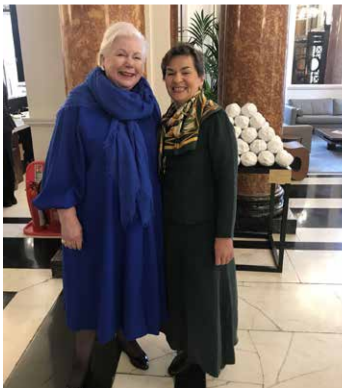
The Lieutenant Governor and Christiana Figueres took part in a roundtable on Sustainable Development Goal 13, Climate Action, at Canada House in London, February 2018.