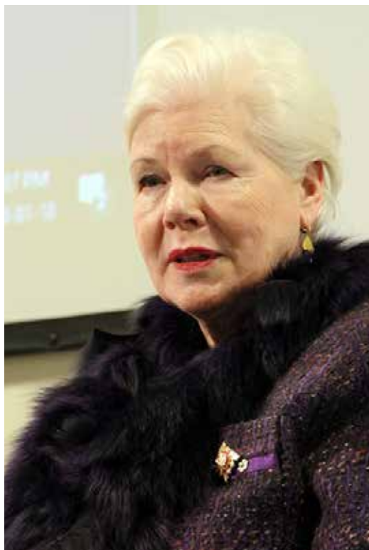
The Lieutenant Governor delivering the Donald Gow Memorial Lecture at Queen's University, January 2018.