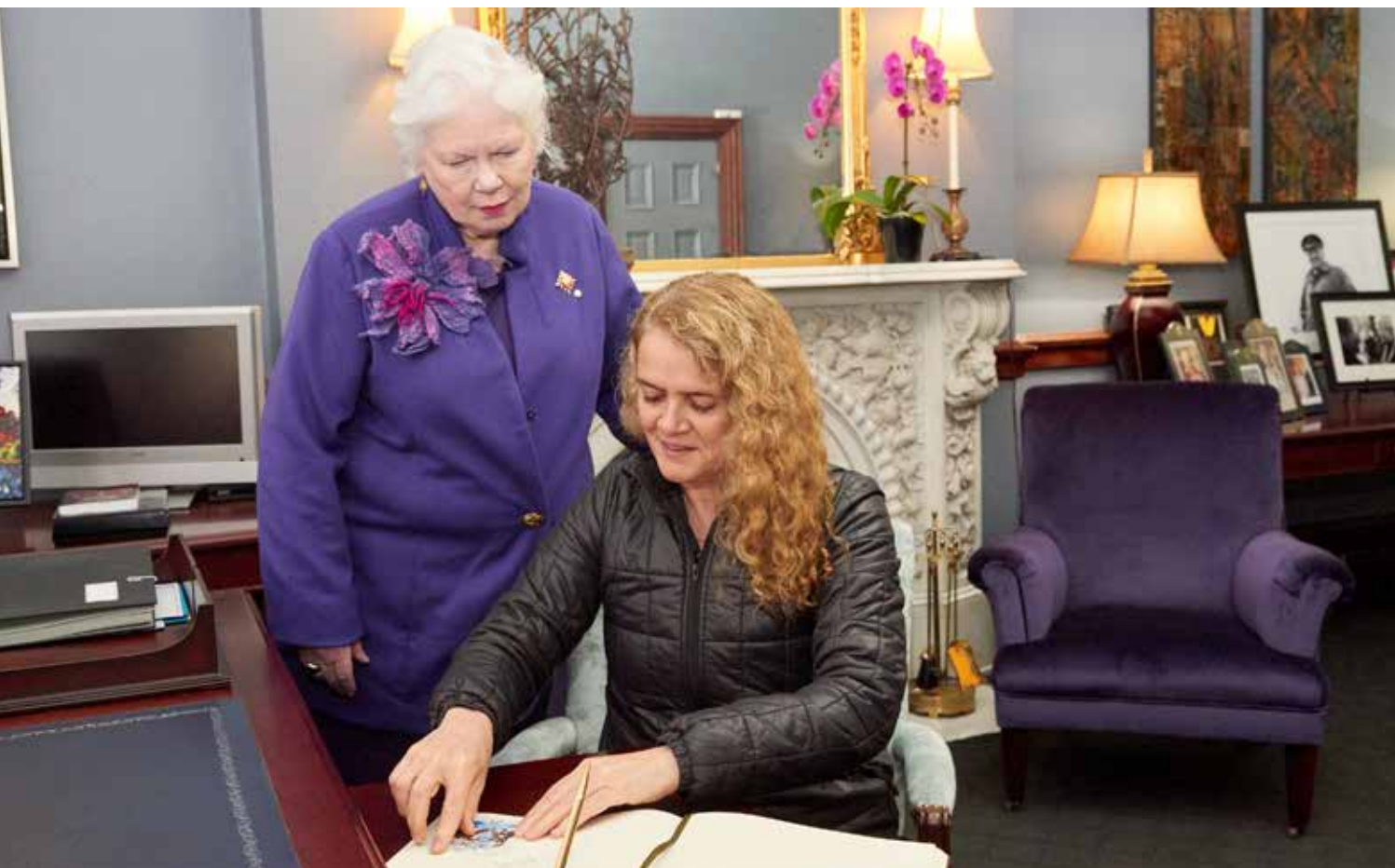
Her Honour welcomed the Rt. Hon. Julie Payette, Governor General of Canada, to the Lieutenant Governor's Suite, February 2018.