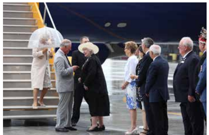
The Lieutenant Governor greeting The Prince of Wales and The Duchess of Cornwall at CFB Trenton, June 2017.