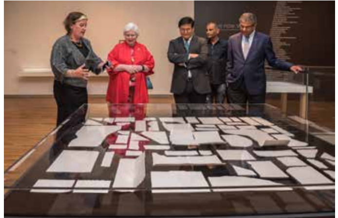
Her Honour viewing artifacts during a visit to the Aga Khan Museum, July 2017.

In April, the Lieutenant Governor attended screening at Silverthorn Collegiate Institute in Toronto as part of the REEL CANADA film festival. In August, Her Honour attended several events as part of the Toronto International Film Festival. In October, she attended a screening in Toronto during the imagineNATIVE Film & Media Arts Festival. In Toronto in November, Ms. Dowdeswell addressed a screening of The Breadwinner , a critically acclaimed film based on the children's book of the same name written by Ontario writer Deborah Ellis. In March 2018, she attended the 2018 Canadian Screen Awards in Toronto.