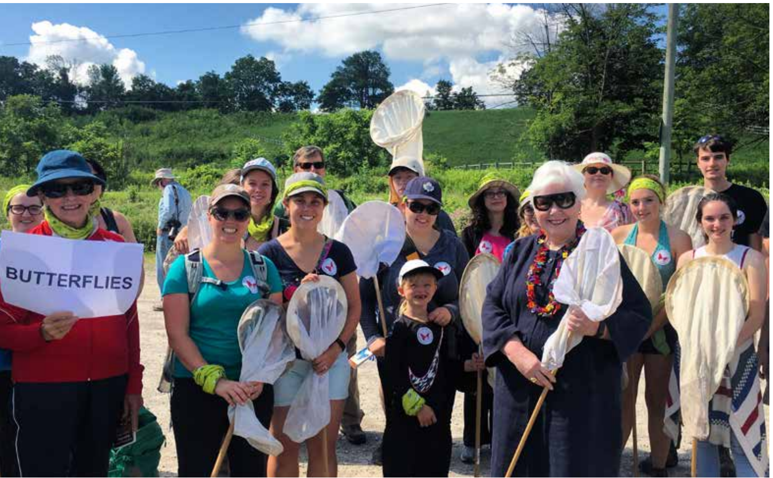
The Lieutenant Governor took part in a bioblitz in Cambridge, joining residents as they catalogued local species, July 2017.