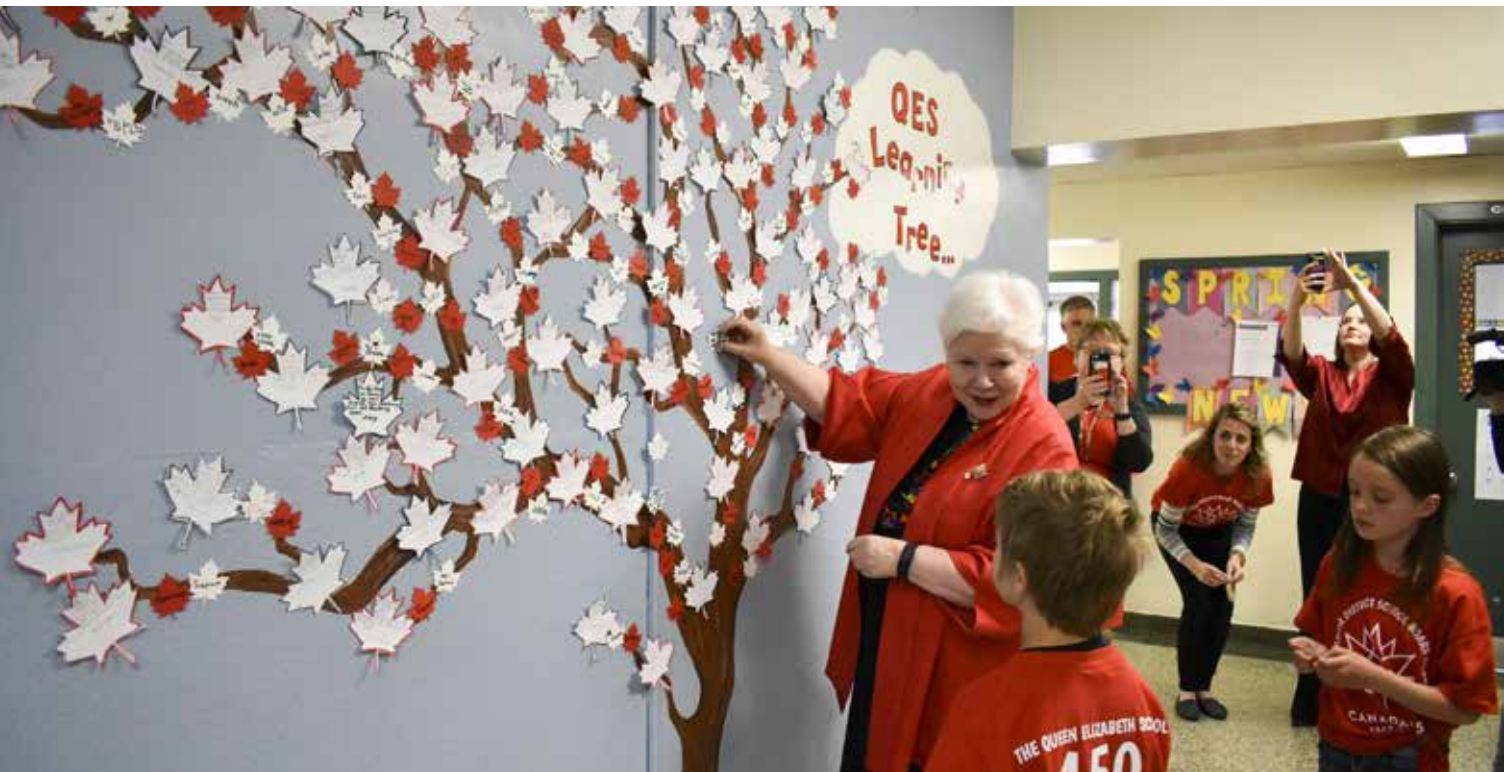
The Lieutenant Governor joined Canada 150 celebrations at Queen Elizabeth Public School in Perth, June 2017.