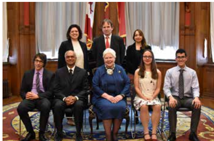
Her Honour posing with winners of the Lieutenant Governor's Climate Change Essay Challenge and representatives from the Centre for International Governance Innovation, April 2017.

In April 2017, Her Honour recognized winners of the Lieutenant Governor's Climate Change Essay Challenge. In collaboration with the Centre for International Governance Innovation in Waterloo, this contest invited Grade 12 students from across Ontario to tell their story of how Canada will have contributed to stopping climate change by 2067. Nearly 150 submissions were considered by a judging panel made up of journalists, teachers, and environmental research fellows. Three winners received a scholarship and winning essays were published by online magazine OpenCanada .