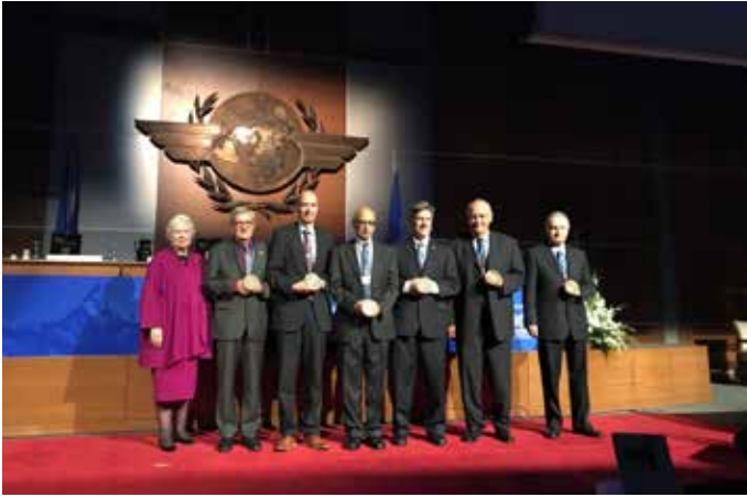
The Lieutenant Governor presented the Scientific Leadership Award as part of the 2017 Ozone Awards of the UN Ozone Secretariat, December 2017.

In November 2017, the Lieutenant Governor addressed 30th anniversary celebrations of the Montreal Protocol on Substances that Deplete the Ozone Layer and presented the Scientific Leadership Award as part of the 2017 Ozone Awards of the UN Ozone Secretariat.