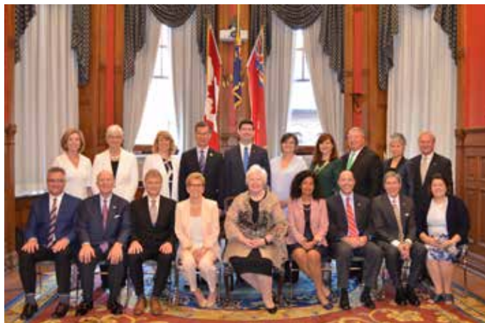
The Lieutenant Governor hosted subnational heads of government and ministers during the Southeastern United States–Canadian Provinces Alliance held in Toronto, June 2017.

While in London, the Lieutenant Governor met with the Canadian High Commissioner, addressed a panel discussion on women in STEM at Canada House, and hosted a roundtable on Sustainable Development Goal 13 (Climate Action) in the company of Christiana Figueres, Executive Secretary of the United Nations Framework Convention on Climate Change. Her Honour took part in events marking the launch of David Milne: Modern Painting at the Dulwich Picture Gallery in London, paying tribute to the many Canadians living in the United Kingdom whose contributions