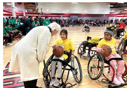
Her Honour with athletes at the 35 th Annual Lieutenant Governor's Games in Toronto in February 2023.

The Variety Village Lieutenant Governor's Games provide an important platform for athletes with disabilities to showcase their skills and compete at a high level, and Her Honour continues to be a proud supporter, promoting inclusivity and accessibility for all Ontarians.