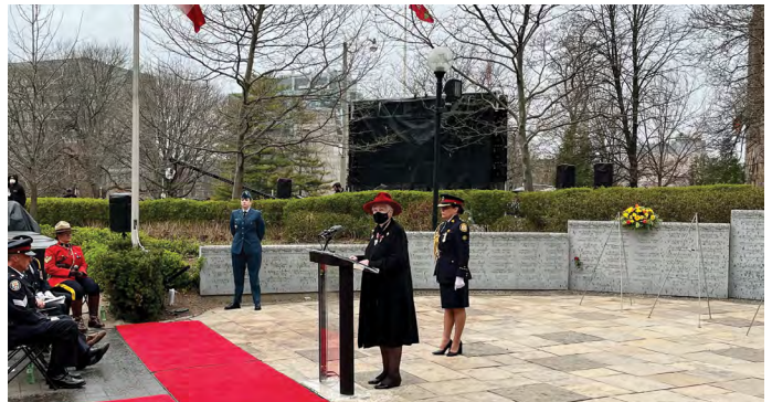
Her Honour gives remarks at the Ontario Police Memorial at Queen's Park in May 2022.

The Lieutenant Governor gave remarks at two of the police funerals and at the Ontario Police Memorial in May 2022. Her Honour's words reminded us of the bravery and courage of those who serve and protect our communities and the gratitude we owe to them. We extend our deepest condolences to the families of these brave officers and pledge to never forget their service and sacrifice.