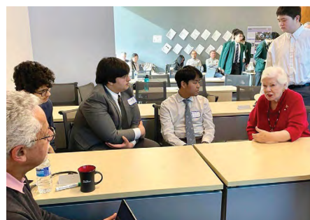
Her Honour in conversation with students at the National High School Big Data Challenge in Toronto in February 2023.

Throughout the event, Her Honour engaged with the students and offered words of encouragement as they presented their findings. It was inspiring to see the enthusiasm and creativity of these young innovators and their work, a testament to the ingenuity and talent of Ontario's youth.