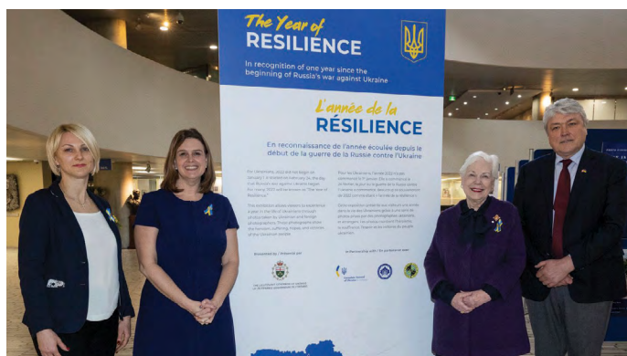
“The Year of Resilience” on display at Toronto City Hall in February 2023.

In February 2023, the Lieutenant Governor’s Office partnered with the Consulate General of Ukraine in Toronto and the International Organization of Ukrainian Communities – Fourth Wave to create a photography exhibition entitled “The Year of Resilience,” marking the one-year anniversary of Russia’s full-scale invasion of Ukraine.