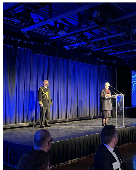
Her Honour addressing the Nordic Council of Ministers at the opening of "Nordic Bridges", a year-long cultural exchange hosted by the Harbourfront Centre in May 2022.