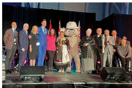
The Lieutenant Governor takes a photo with mascot Pachi the Porcupine at the 2023 Parasport Games in Durham Region in February 2023.

In February 2023, Her Honour helped open the Parasport Games in Durham Region. With over 1,000 attendees, the Games certainly lived up to their "Be the Roar" tagline.