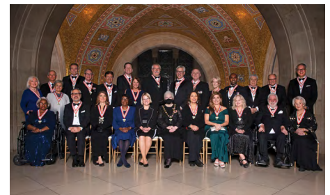
The Lieutenant Governor sits for a photo with the 2021 Order of Ontario Appointees at the Royal Ontario Museum in November 2022.