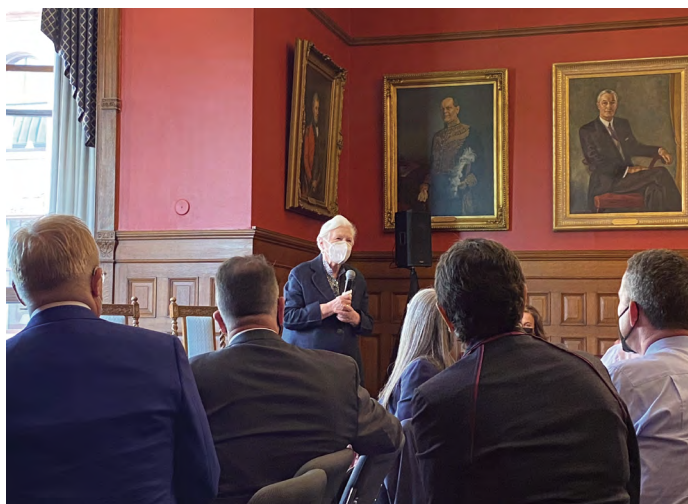
Her Honour delivers remarks at the Symposium on Calibrating the Climate Transition hosted in the Lieutenant Governor's Suite in May 2022.

In May 2022, Her Honour hosted a one-day symposium called “Calibrating the Climate Transition: Sustainability, Energy Security, Prosperity, and Social Impact in the Cold War II Era”, in partnership with BMO Climate Institute and The Long Run Institute. Gathering experts, dignitaries, and leaders from various sectors, the event sought to address the critical challenges and opportunities posed by the modern geopolitical climate.