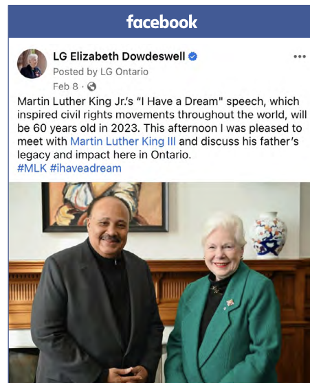
Her Honour posts on Facebook about meeting Martin Luther King III in the Lieutenant Governor's Suite in February 2023.