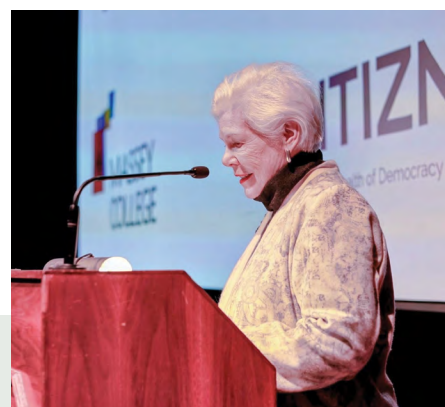
Her Honour gives remarks at the screening of 2020: Chaos and Hope at the George Ignatieff Theatre in Toronto in January 2023.

– Excerpt from Her Honour’s remarks at the 2020: Chaos and Hope screening, January 23, 2023.