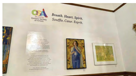
Some of the art from the "Breath. Heart. Spirit." exhibition in the Lieutenant Governor's Suite.

The Office of the Lieutenant Governor hosted the opening of the "Breath. Heart. Spirit." art exhibition in the Lieutenant Governor's Suite on October 18, 2022. The exhibit features over 100 artists and was the final exhibition of a celebratory year for the Ontario Society of Artists (OSA), marking their 150 th anniversary. The launch was attended by Her Honour, as well as a number of the artists whose works were on display, and celebrated the important role that art can play in inspiring people to connect with their innermost selves and with their communities.