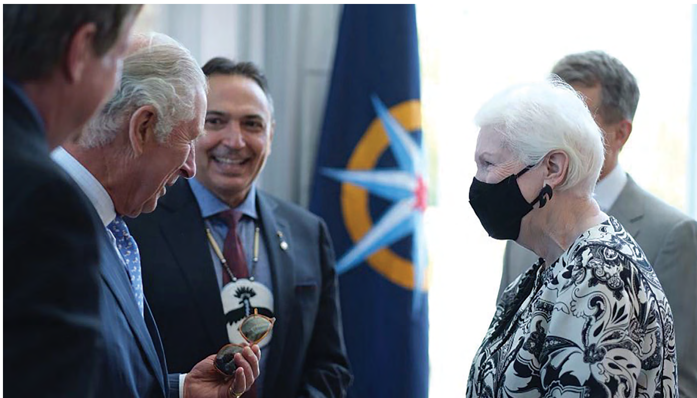
The Lieutenant Governor in conversation with the then-Prince Charles during his visit to Ottawa in May 2022.