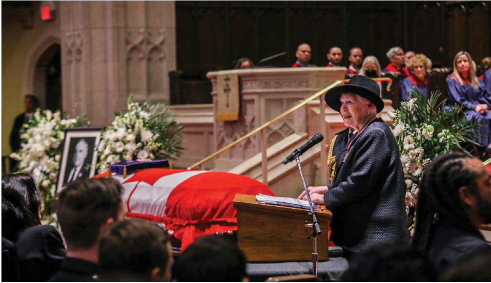
The Lieutenant Governor gives remarks at David C. Onley's funeral at Yorkminster Park Baptist Church in Toronto in January 2023.