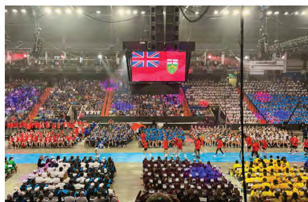
Athletes, coaches, volunteers, and spectators gather at the opening ceremony of the Canada Summer Games in St. Catharines in August 2022.

In August 2022, Her Honour attended the 2022 Canada Summer Games in Niagara Region, the largest multi-sport event in the country. The Lieutenant Governor addressed the thousands in attendance, highlighting the importance of sports and physical activity in promoting healthy lifestyles and building strong communities.