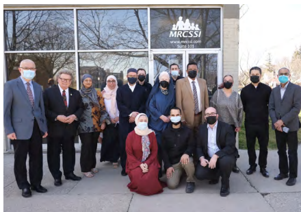
Her Honour with community members at the Muslim Resource Centre for Social Support and Integration in London in April 2022.