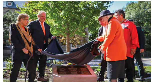
Unveiling of the Platinum Jubilee Garden at Queen's Park in September 2022.