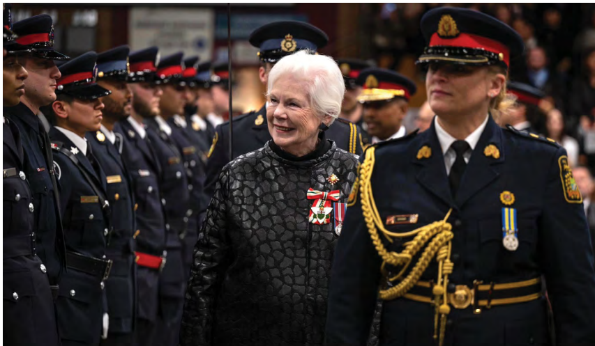
The Lieutenant Governor attends the Ontario Police College graduation in Aylmer in March 2023.

"Looking out at this graduating cohort, I am inspired to see so many of you here, and such a diverse representation of people, from every region of our province.