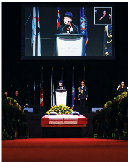
The Lieutenant Governor gives remarks at Hazel McCallion's state funeral in Mississauga in February 2023.

Among many who passed in 2022-23, we also paid tribute to individuals who were of particular significance in our civic life.