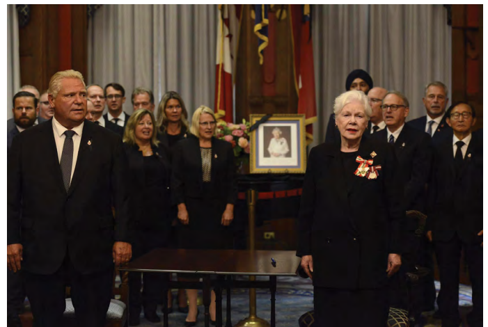
Her Honour with the Executive Council at the Ontario Accession Proclamation Ceremony at Queen's Park in September 2022.

The accession of The King signals a new chapter in our history and underscores the strength of our democratic institutions and the peaceful transfer of power from one generation to the next. As we begin this new era of the monarchy under King Charles III, we are reminded of the essential role that the Crown plays in our constitutional system, as a symbol of our unity, stability, and shared values.