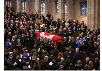
Bottom — Mr. Onley's funeral at Yorkminster Park Baptist Church in Toronto in January 2023.

In January 2023, the Office of the Lieutenant Governor of Ontario was saddened to announce that the 28 th Lieutenant Governor of Ontario, renowned broadcaster, and advocate, the Honourable David C. Onley, had passed away.