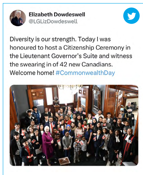
Her Honour tweets about a Citizenship Ceremony held in the Lieutenant Governor's Suite in March 2023.

Her Honour maintains an active social media presence on Facebook, Instagram, and Twitter, in order to amplify the many diverse stories and life events of Ontarians. Below are three examples of leading posts from each of these platforms.