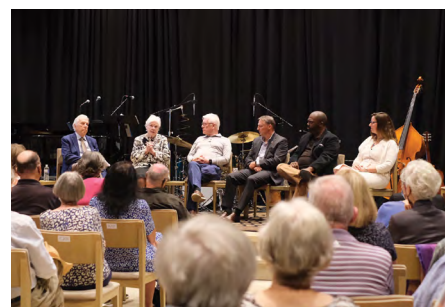
Her Honour speaks at the Stratford Festival's Meighen Forum on "Staging Democracy" in August 2022.

At Queen's Park, Her Honour hosted a reception to celebrate the 100 th anniversary of the Women's Music Club of Toronto.