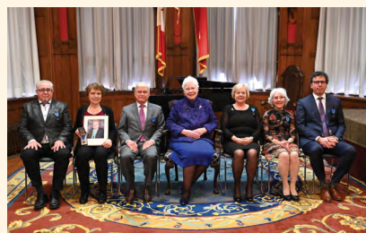
The Lieutenant Governor hosts the Ordre de la Pléiade ceremony at Queen's Park in March 2023, during Semaine de la Francophonie.

Ontario Junior Citizen Awards (Ontario Community Newspapers Association)