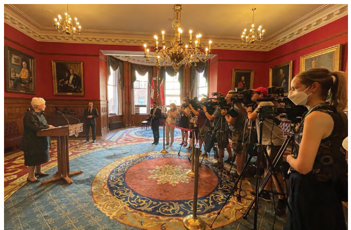
The Lieutenant Governor addresses the Queen's Park Press Gallery following the news of the Queen's passing on September 8, 2022.

The memorial was open to the public and offered Ontarians an opportunity to remember and celebrate the life of the Queen, who was the only Sovereign most Canadians had ever known.