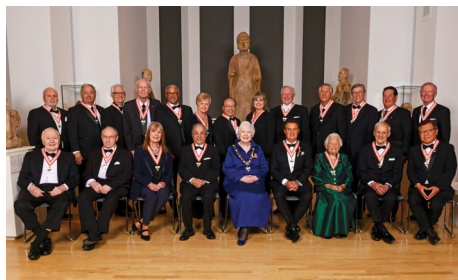
Her Honour sits for a photo with the 2020 Order of Ontario Appointees at the Royal Ontario Museum in October 2022.