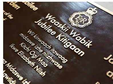
Plaque in front of the Platinum Jubilee Garden at Queen's Park, featuring words in English, Anishinaabemowin, and French.