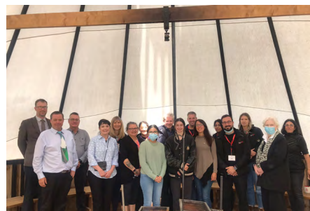
Her Honour and GGCLC participants at Northern Lights Secondary School in June 2022.

Back at Queen's Park, Her Honour hosted another group of GGCLC participants for a roundtable focused on democracy in Canada.