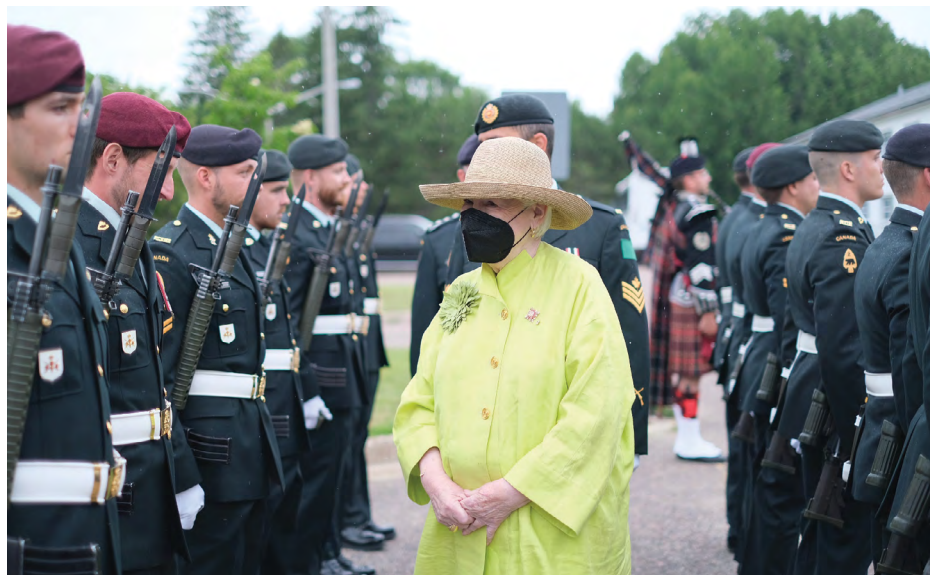
Her Honour inspecting a quarter guard at Garrison Petawawa in June 2022.

On May 1, 2022, Her Honour served as the Inspecting Officer at the Governor General's Horse Guards' Trooping of the Standard. Her Honour addressed the parade and commended the Regiment for 200 years of service.