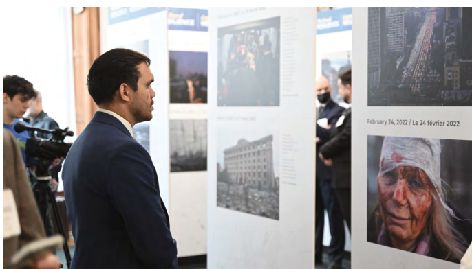
“The Year of Resilience” on display at the Lieutenant Governor’s Suite in February 2023.