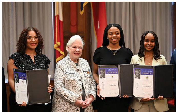
Her Honour presents the Lincoln Alexander Awards at the Lieutenant Governor's Suite in February 2022.