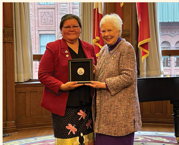
Her Honour presents the IPAC Award in the Lieutenant Governor's Suite in October 2022.