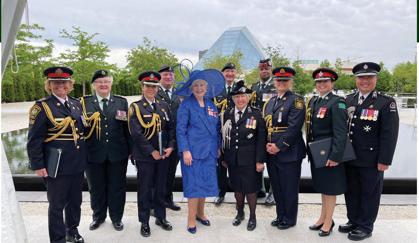
Her Honour with ten aides-de-camp at the Platinum Jubilee Garden Party in June 2022.