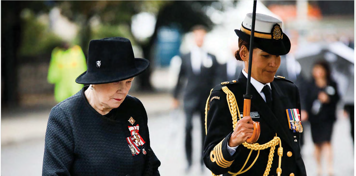
Her Honour attends the National Memorial for Queen Elizabeth II in Ottawa in September 2022.