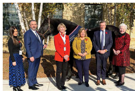
Her Honour at the 100 th annual Royal Agricultural Winter Fair in Toronto in November 2022.

For a century, the Royal Agricultural Winter Fair has played a valuable role in offering Ontarians opportunities to learn about Canada's rich and diverse agricultural landscape, its equestrian excellence, as well as the scientific and technological innovation behind food's journey from farm to fork.