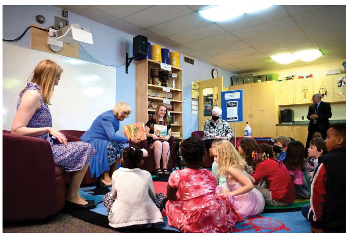
Her Honour and the then-Duchess of Cornwall, Camilla, read to students at Assumption Elementary School in Ottawa in May 2022.

In May 2022, Her Honour was delighted to welcome the then-Prince of Wales, His Royal Highness Prince Charles, and the then-Duchess of Cornwall Camilla, to Canada, when they visited Ottawa as part of their Platinum Jubilee Tour. Their visit was significant, as it was the last visit the Prince of Wales made to Ontario before ascending to the throne as our new King.