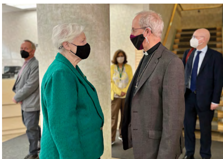
Her Honour with the Archbishop of Canterbury in May 2022.

In May 2022, the Archbishop of Canterbury, Justin Welby, held a meeting with residential school survivors in Brantford and invited Her Honour to participate in the historic gathering hosted by the Anglican Church of Canada. The meeting was aimed at discussing the ongoing reconciliation efforts between Indigenous Peoples and non-Indigenous Canadians.