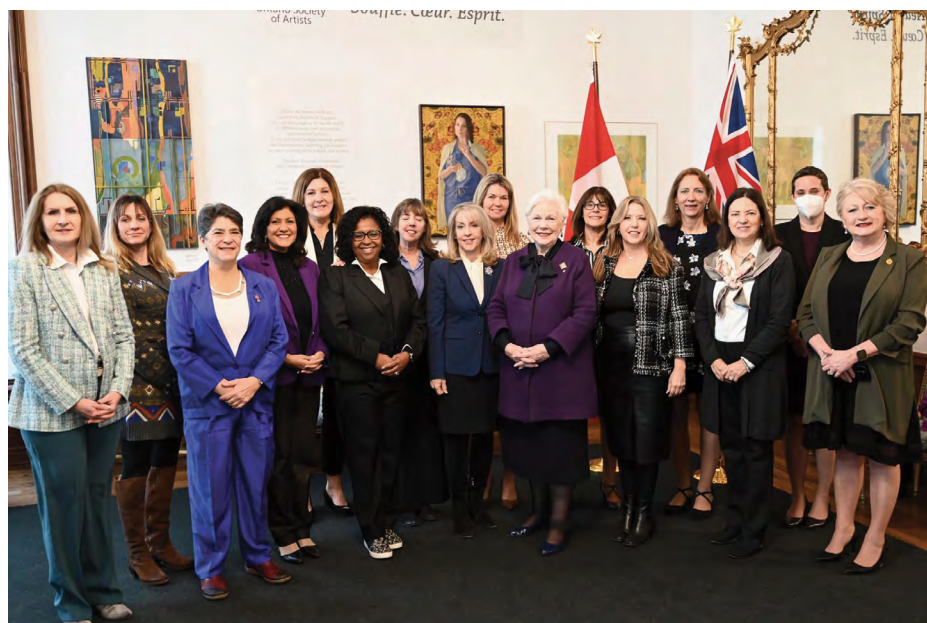
Her Honour with attendees of the International Women’s Day breakfast hosted in the Lieutenant Governor’s Suite on International Women’s Day, March 8, 2023.

Each year on March 8, International Women’s Day (IWD) serves as a reminder of the challenges that women everywhere face in their careers and in their lives.