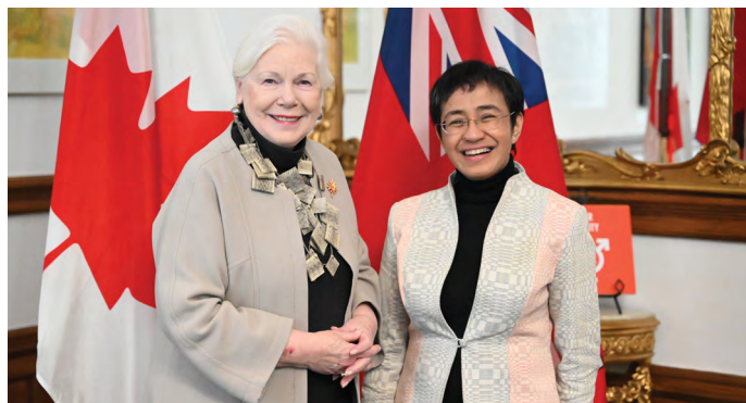
Her Honour welcomed renowned journalist and Nobel Peace Prize laureate Maria Ressa – the keynote speaker at the DemocracyXChange – to the Lieutenant Governor’s Suite in March 2023.

This past March, Her Honour was invited to participate in the DemocracyXChange, a conference that brought together a diverse group of leaders to discuss issues related to democracy, civic engagement, and public policy.