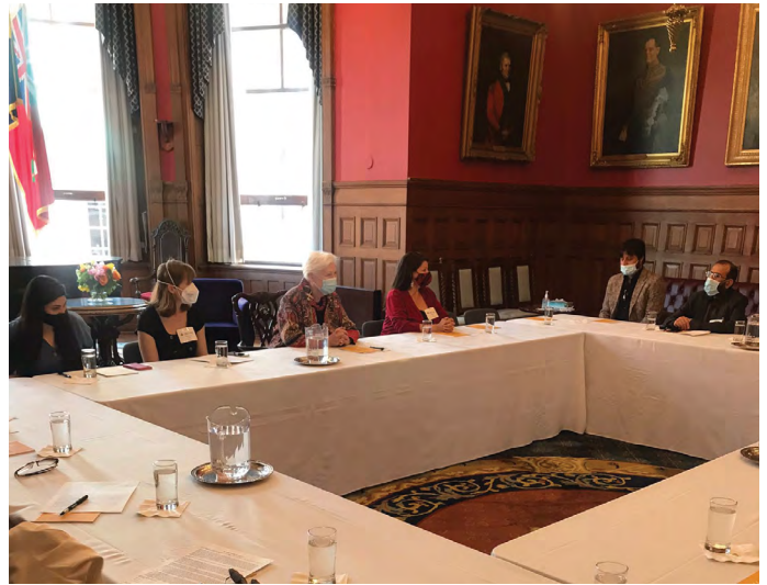
The Lieutenant Governor hosts a roundtable on Afghanistan with Journalists for Human Rights in May 2022.

The day concluded with the presentation of the JHR Journalist in Residence Fellowship, a program that offers work placement opportunities at some of Canada's leading media organizations to Afghan journalists and media professionals in Canada.