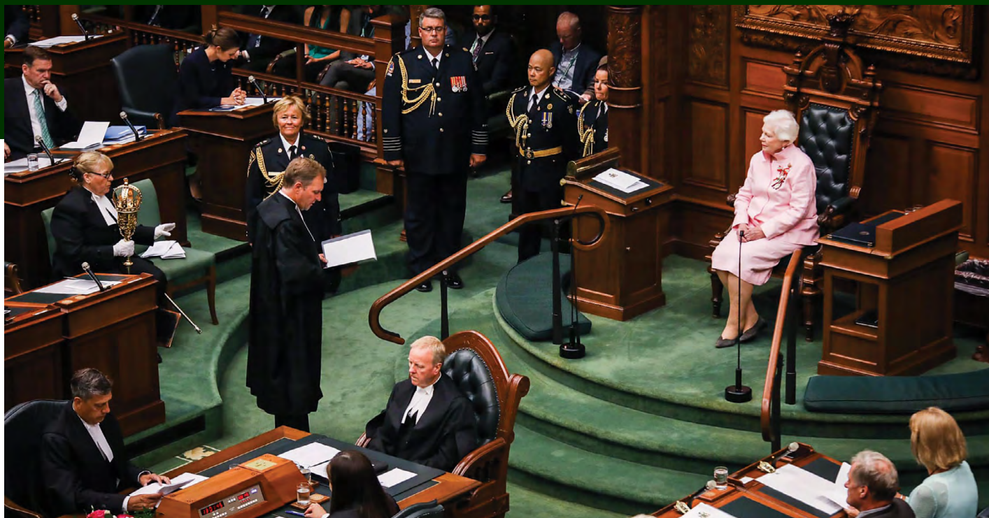
Her Honour at the Speech from the Throne Ceremony, August 2022.