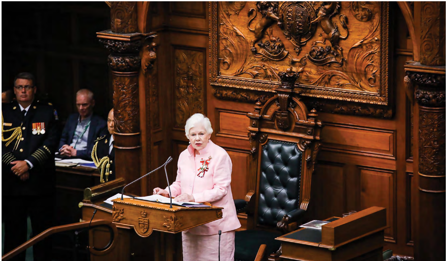
Her Honour delivers the Speech from the Throne in August 2022.