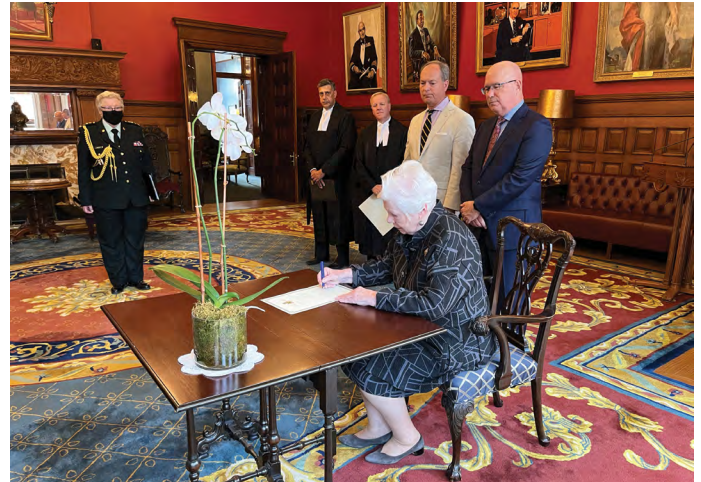
The Lieutenant Governor grants Royal Assent at Queen's Park, just moments before receiving word that the Queen had passed away in September 2022.

On the afternoon of September 8, just moments before Buckingham Palace announced that Queen Elizabeth II had passed away, Her Honour granted Royal Assent in Her Majesty's name. This is likely to have been the last instance in the Commonwealth where Royal Assent was granted in the name of Queen Elizabeth II.