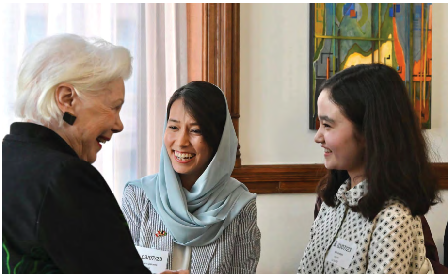
Her Honour enjoys a conversation with two Afghan girls at the reception welcoming Afghan refugees to Canada in March 2023.

In March 2023, in partnership with the Prince's Trust and the 30 Birds Foundation, Her Honour hosted a reception to welcome a group of Afghan girls to Canada and thank the remarkable volunteers and supporters who helped bring these refugees to Canada.