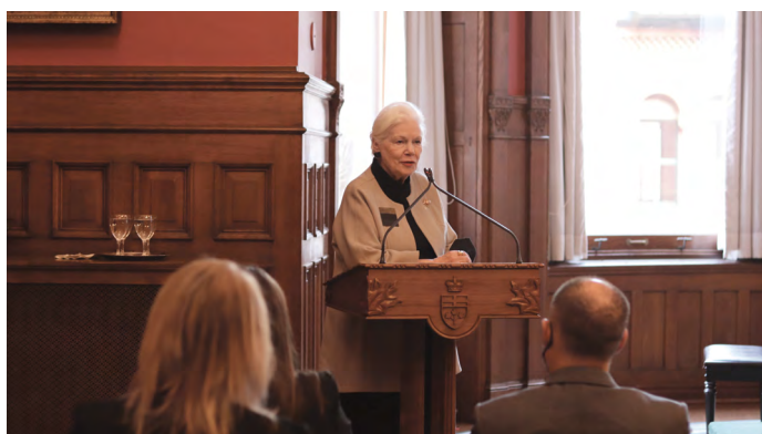
Her Honour gives remarks at the Report Launch for the Canadian Climate Institute at the Lieutenant Governor's Suite in November 2022.

The Canadian Climate Institute released its Damage Control report in October 2022, telling the story of the cost of inaction on climate change and the need for immediate action. The report spotlights the intersection between climate action, sustainable economic growth, and social justice, with a focus on the economic impacts of climate change.