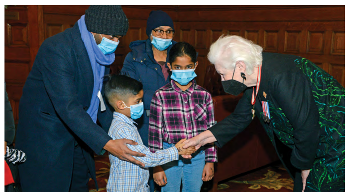
Her Honour meets a family visiting the Lieutenant Governor's Suite for the New Year's Levee in January 2023.

Her Honour was grateful to be able to meet with Ontarians in person, after so many years apart due to the pandemic, and also to have the opportunity to thank so many of them personally for their countless contributions throughout the year.