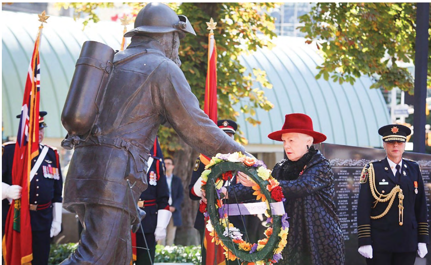
Her Honour places a wreath during the Ontario Fire Fighters Memorial Ceremony in Toronto in October 2022.

The Honourable Elizabeth Dowdeswell is the 29 th Lieutenant Governor of Ontario and is the second-longest serving lieutenant governor in the history of the province. As the representative of His Majesty The King, Ms. Dowdeswell carries out constitutional and ceremonial duties and facilitates healthy citizen and community engagement.