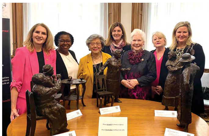
The Lieutenant Governor with special guest attendees of the Famous Five & Persons Day event hosted in the Lieutenant Governor’s Suite in October 2022.

Persons Day is an important reminder of the unfinished work of achieving gender equality in Canada. Although significant progress has been made in the last century, there is still much more to be done to ensure equal opportunities for all Canadians. The reception offered an opportunity to spark dialogue on gender equality and social inclusion, and to celebrate the accomplishments of women who have paved the way for future generations.