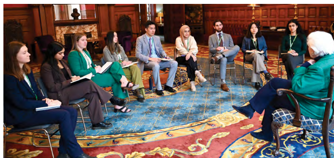
The Lieutenant Governor in discussion with Ontario Legislative Internship Programme (OLIP) Interns in March 2023.

Her Honour always appreciates the opportunity to engage with young people, as she believes that engaging with youth is critical to ensuring an informed and active citizenry in Ontario’s democracy.