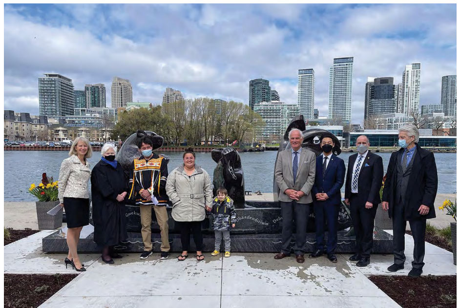
Her Honour attends the unveiling of First Nations sculpture at Billy Bishop Airport in May 2022.

For the 2.8 million people who annually fly in and out of the airport, it is also a powerful reminder of the importance of recognizing Indigenous contributions to Ontario's society and promotes the urgently important ideals of reconciliation and cultural unity.