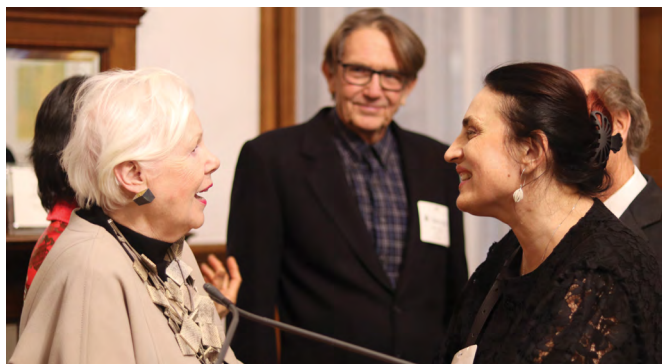
The launch of "Breath. Heart. Spirit." in the Lieutenant Governor's Suite in October 2022.