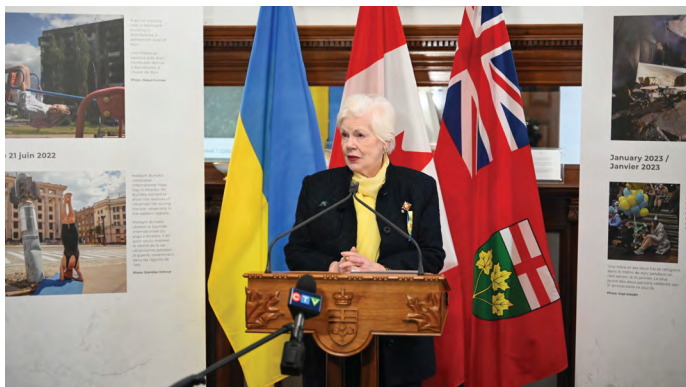
The Lieutenant Governor gives remarks at the “The Year of Resilience” exhibition in the Lieutenant Governor’s Suite in February 2023.