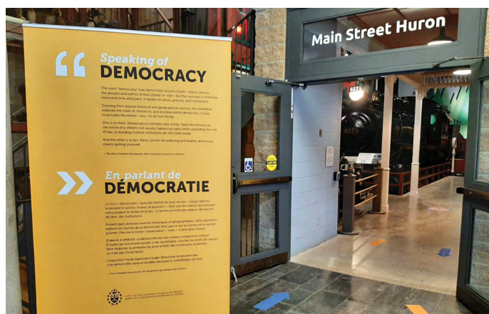
"Speaking of Democracy" on display at the Huron County Museum in May 2022.

The mobile exhibition has been displayed at Huron County Museum, Midland Public Library, Mississauga Civic Centre, Queen's Park, Massey College for the screening of 2020: Chaos and Hope , and the DemocracyXChange conference in Toronto. For more information about how the exhibition can be displayed in your community, visit www.lgontario.ca .