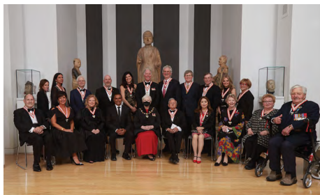
The Lieutenant Governor sits for a photo with the 2019 Order of Ontario Appointees at the Royal Ontario Museum in April 2022.

– From Her Honour's remarks at the Order of Ontario Investiture, November 21, 2022.