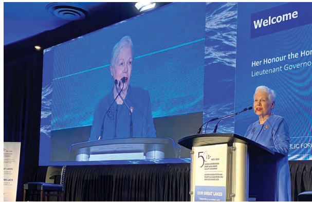
The Lieutenant Governor delivers remarks at the Great Lakes Public Forum in Niagara Falls in September 2022.

From addressing the impacts of climate change on our water systems to promoting sustainable economic development, there was no shortage of important topics to explore. Participants were united in their commitment to protecting our shared natural resources and promoting a sustainable future for all. As a lifelong advocate of sustainability, Her Honour was pleased to deliver remarks, reminding listeners of the importance of working together to address the challenges facing our communities and our planet.